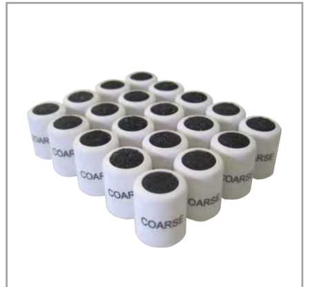
NAME: COARSE DISPOSABLE TIPS (PER 20) CODE: SC214