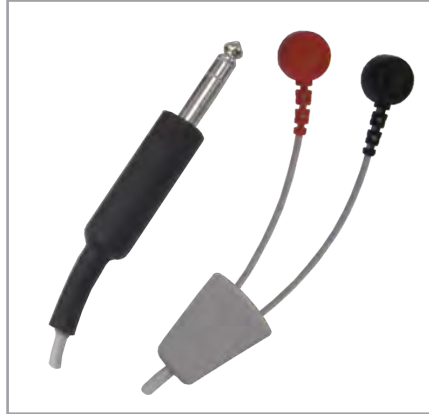
NAME: ETR LEADS (PAIR) CODE: SC145