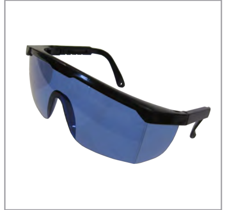
NAME: ANTI-GLARE EYEWEAR CODE: SC237