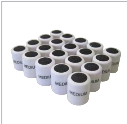
NAME: MEDIUM DISPOSABLE TIPS (PER 20) CODE: SC213