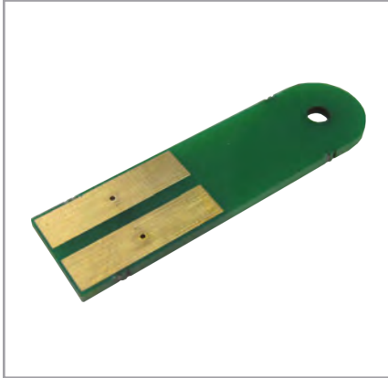
NAME: WRINKLE COMB TESTER CODE: SC238