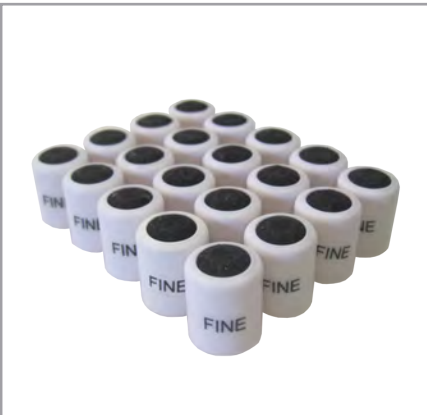
NAME: FINE DISPOSABLE TIPS (PER 20) CODE: SC212