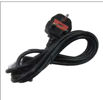
NAME: MAINS LEAD CODE: MLEAD