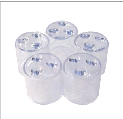
NAME: DERMAL MASSAGE HEADS (PER 5) CODE: SC215