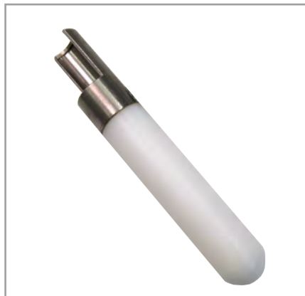
NAME: ABRASIVE TIP REMOVER CODE: SC210