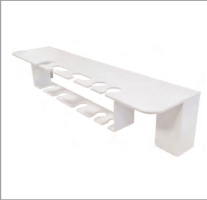
NAME: ATTACHMENT HOLDER CODE: SC235