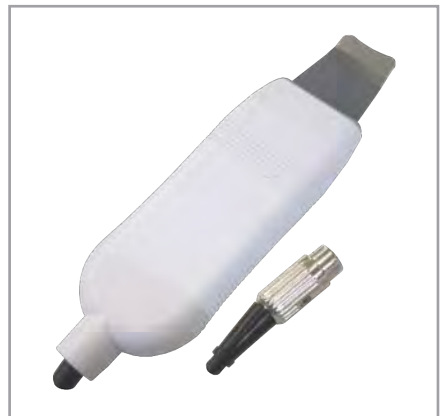
NAME: ULTRASONIC ACTUATOR CODE: SC157