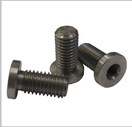
NAME: SCREW IN ADAPTERS CODE: SC234