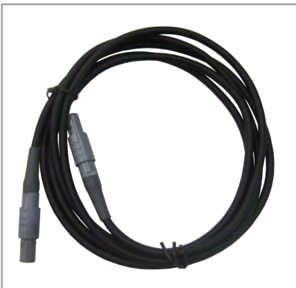
NAME: ORBITAL ABRADER CABLE CODE: SC209