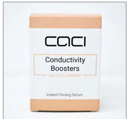
NAME: CONDUCTIVITY BOOSTERS CODE: CB