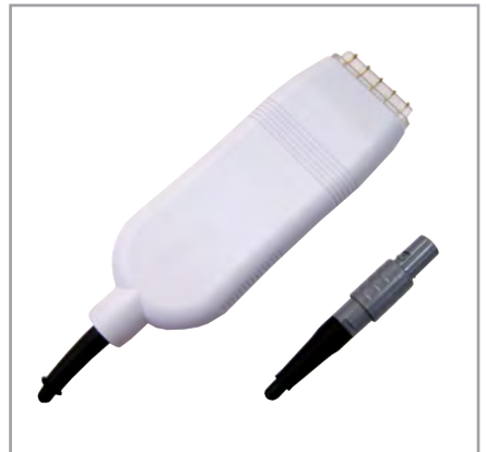
NAME: SYNERGY WRINKLE COMB HANDSET CODE: SC231