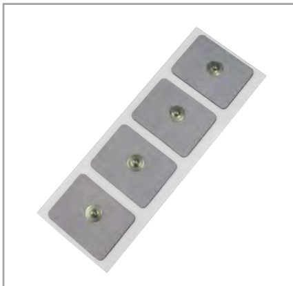
NAME: SMALL SELF-ADHESIVE PADS CODE: QNTSPAD