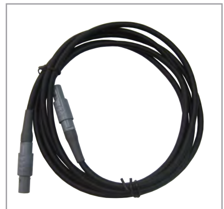
NAME: LED MICRO PROBE HANDSET CABLE CODE: SC232